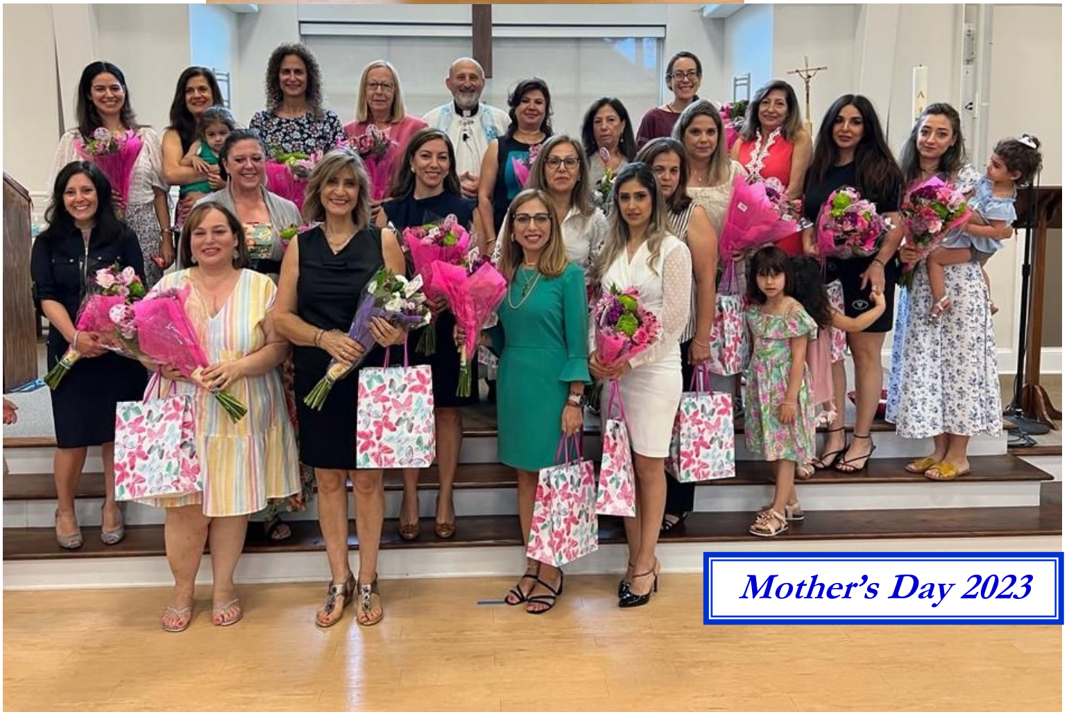
Mother's Day 2023