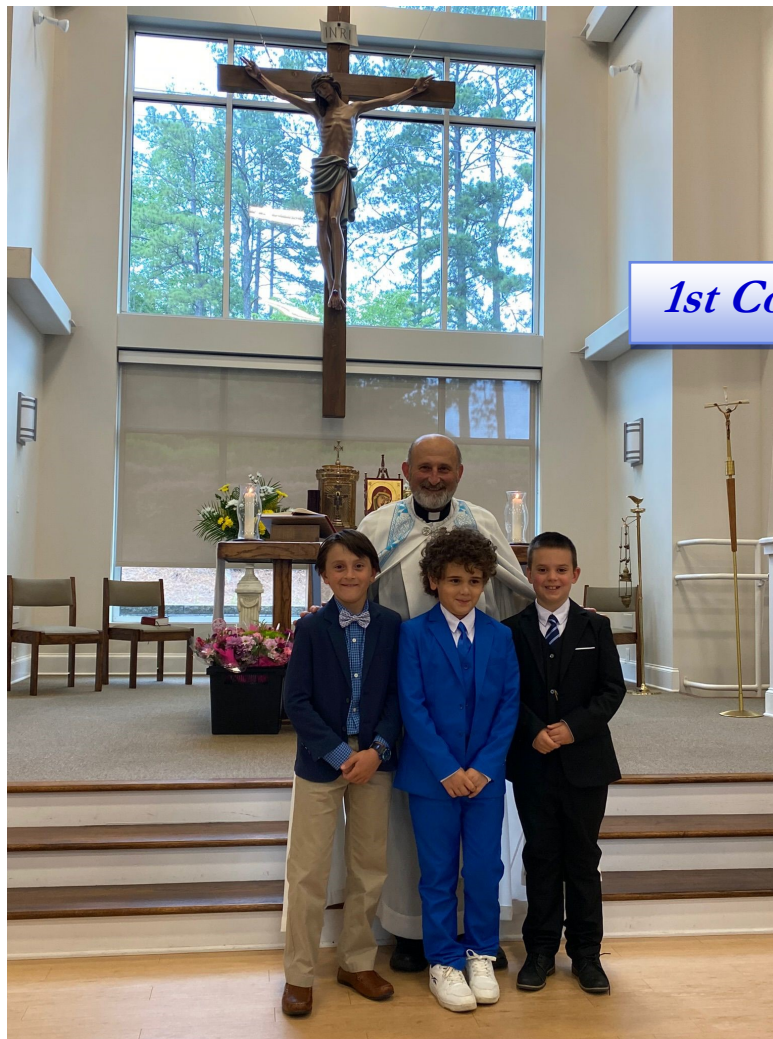
1st Communion, May 2023